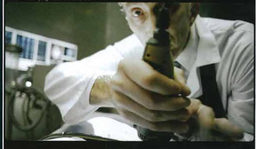
The Doritos campaigns are a site to behold